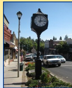
Club 529 chartered March 16, 1925