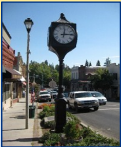
Club 529 chartered March 16, 1925