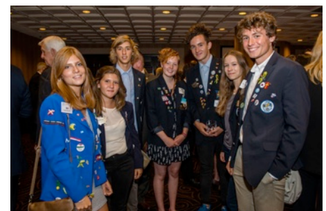
RYE students are treated to an evening to remember in the the U.S. along with RI President