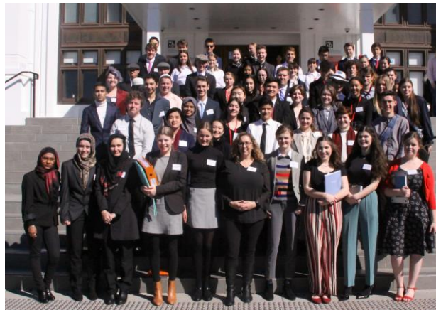
2019 National MUNA