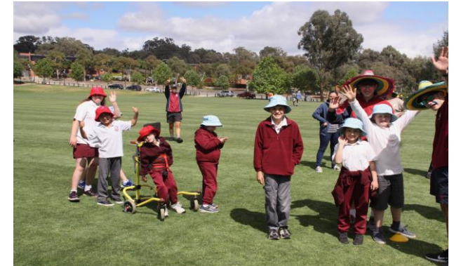
2019 Dream Cricket Gala Day