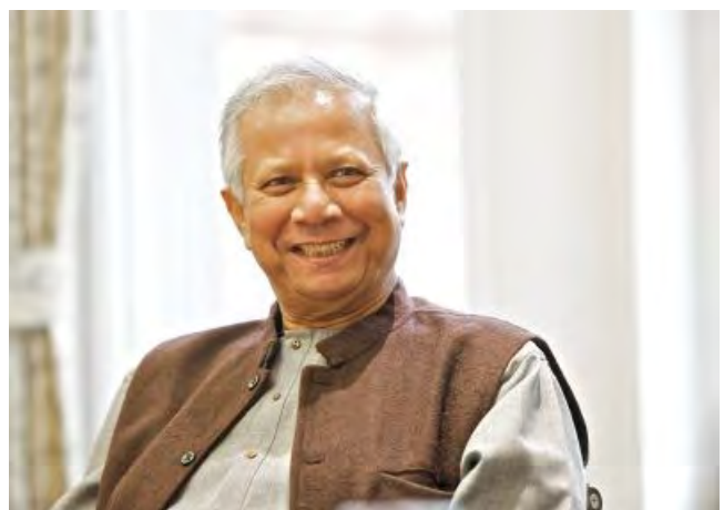
Nobel Peace Prize Winner, Muhammad Yunus was a keynote speaker at the Sydney Peace Conference

Rotaractors will join us at the Australia New Zealand Rotary Confer-