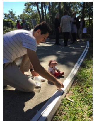
Coin km Griffith