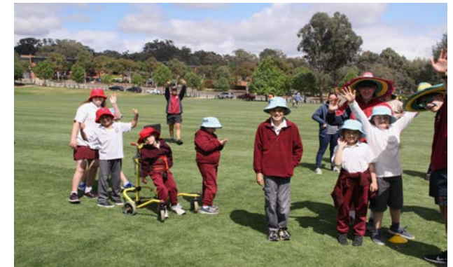
2019 Dream Cricket Gala Day