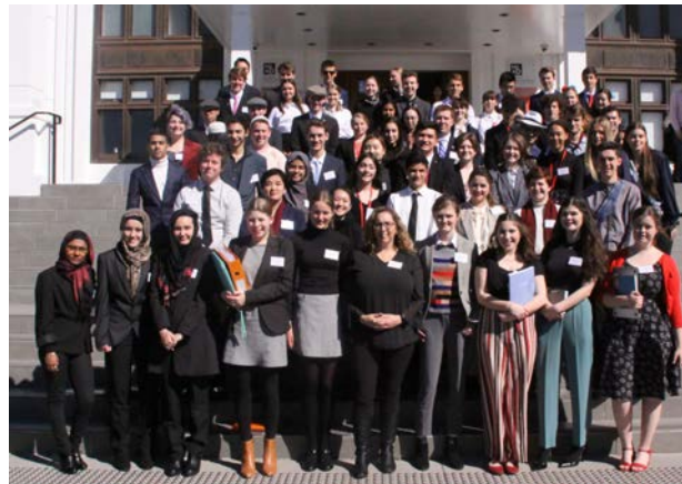
2019 National MUNA