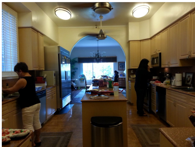
Club members participation in Ronald McDonald House project.