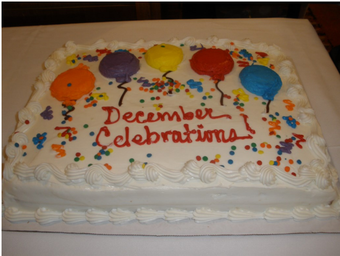
The December Birthday Cake