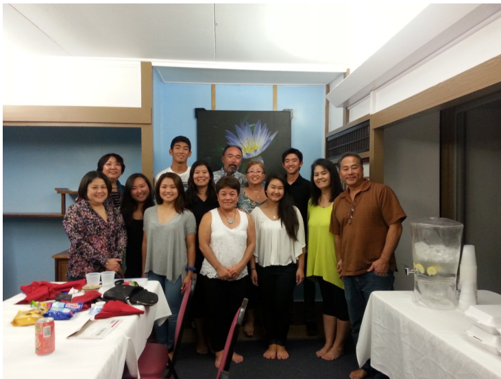
Students and chaperones preparing for their meeting with our sister club in Kyoto, Japan.