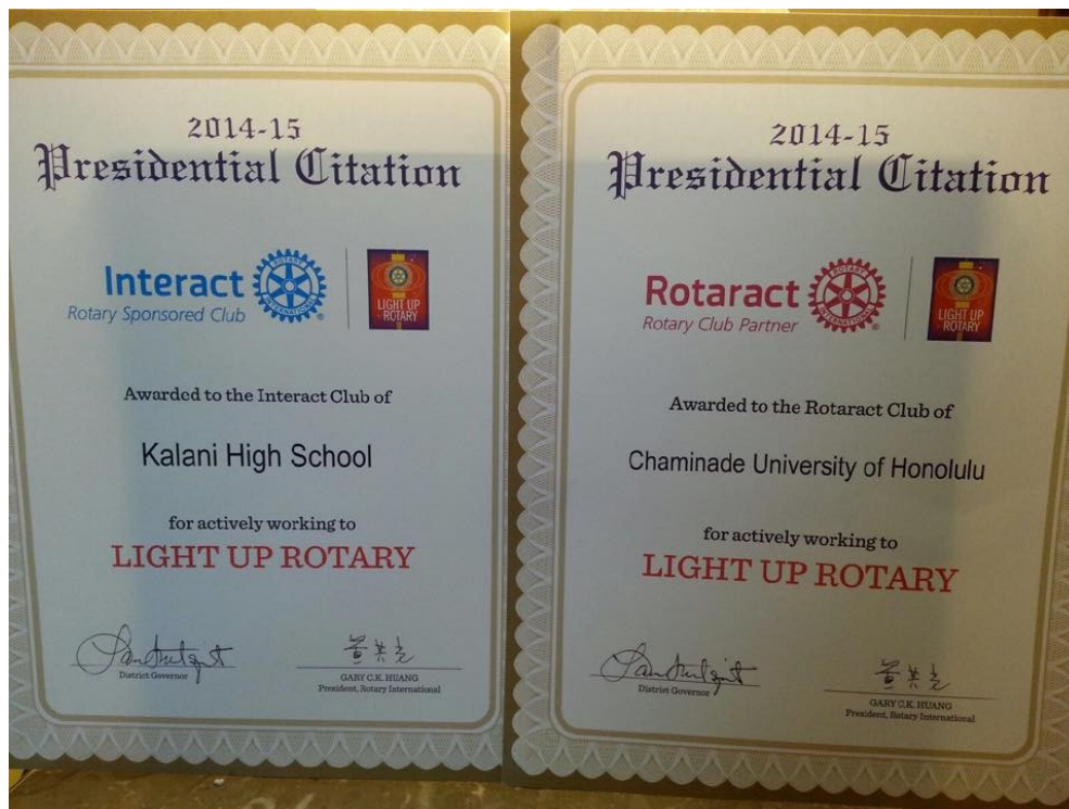
Interact and Rotaract Citations