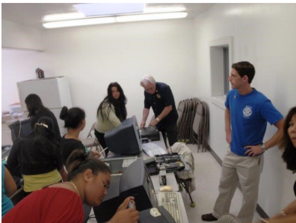
Sorting School Supplies