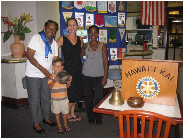
Late Ducky Dash Winner