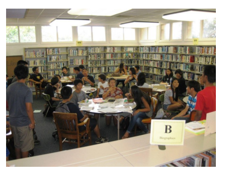
Kaiser High School Interact Club