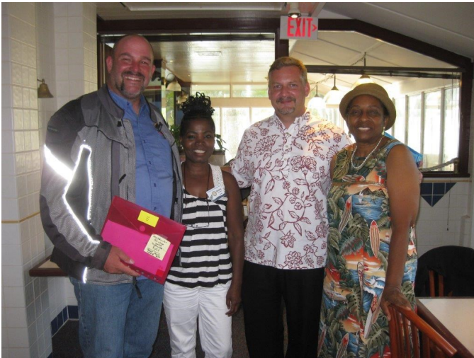
Late Ducky Dash Winner