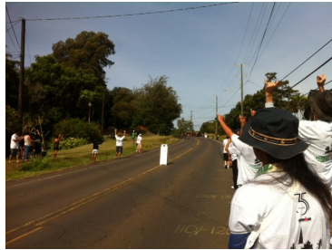
Rotary and other Volunteers lined up on the road to cheer on the first cyclist near the turnaround station!