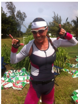
This happy athlete is celebrating her birthday, her new marriage ceremony in Hawaii and her fifth and final Ironman competition!