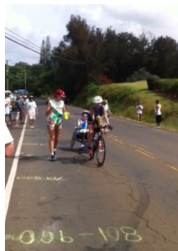
An amazing athlete who pulled her very disabled friend along for the ride- talk about embodying the spirit of the Ironman!