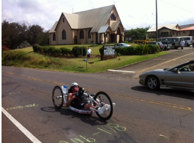
An inspiration . . . A beautiful female athlete at the 60 mile mark.