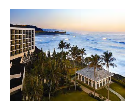
Turtle Bay Resort See District 5000 website to register