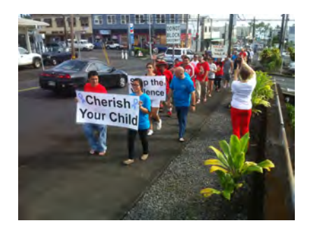
Rotaractors finishing the walk up Haili Street.