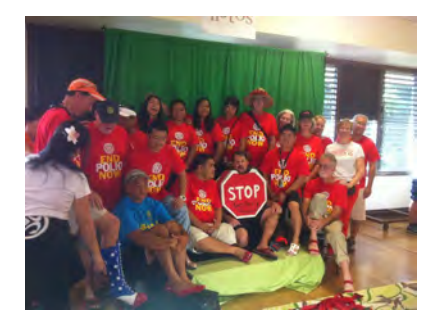
Team Rotary before the eventcomprised of 10 Rotarians and 5 Rotaract members.