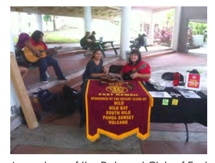
4 members of the Rotaract Club of East Hawaii casually soliciting donations on Friday, October 25 at the University of Hawaii at Hilo Campus Center.