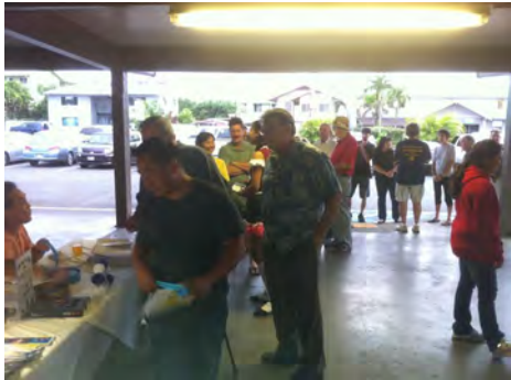
At times, the line was long to get in...