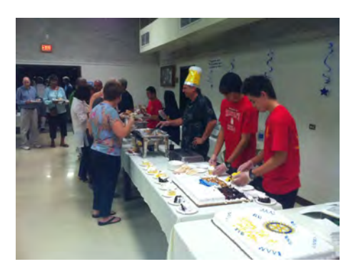
Rotaractors applying their academic knowledge to serve cake.