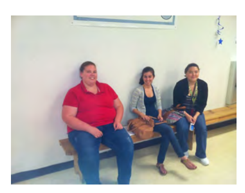
The Rotaract security group resting before the event starts.