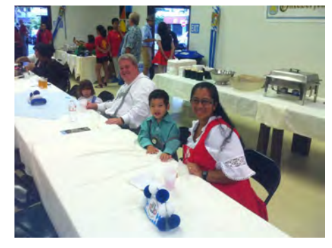
The Family Goodenow enjoying a peaceful moment together.