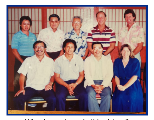
Who do you know in this picture?

Yesterday's Memories are tomorrows Treasures