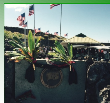
Pictured Top L-R: