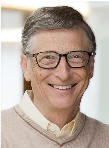
Bill Gates will be Keynote Speaker at Rotary International Convention

It has now been announced that Ashton Kutcher will speak about his work to end child sexual exploitation. Mr. Kutcher, co-founder of Thorn, actor, tech investor, and philanthropist will join the End of Modern Slavery panel discussion during the second general session. Thorn partners with nonprofits and academic institutions to gather new insights into the role technology plays in child sex trafficking, the creation and proliferation of child pornography, and the normalization of child sexual exploitation. Thorn then goes beyond insight to action to develop the tools, systems, and approaches to help address these issues.