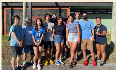
Interactors volunteering at the Mililani Public Library

Also, monetary donations or raffle/team prizes would be greatly appreciated and beneficial to the success of our event.