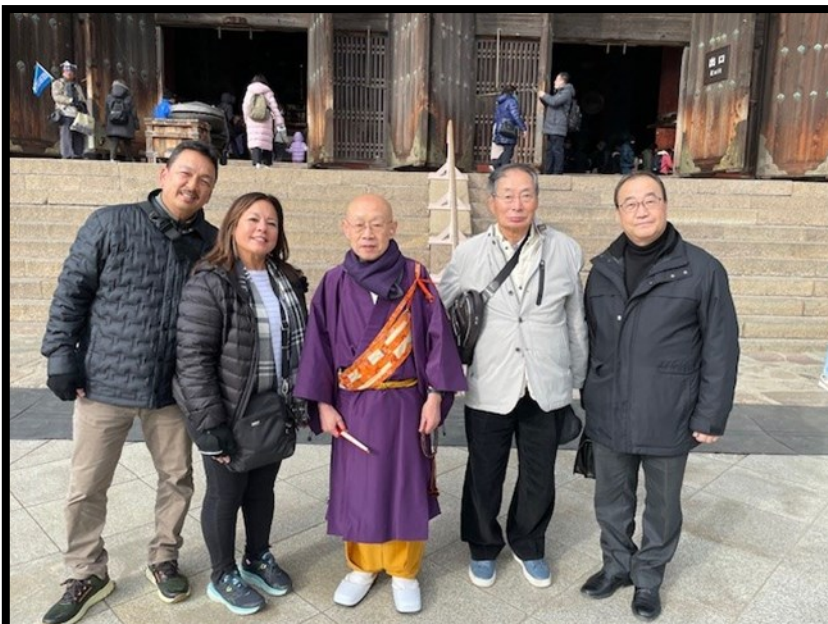
At Todai-ji Temple