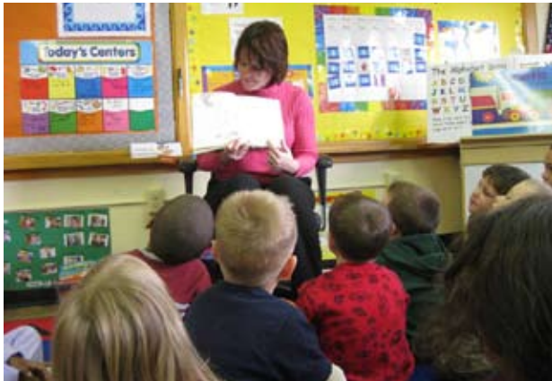
Adopt-A-School Program at Diven

Members may join Rotary for many reasons, including community involvement, personal development, professional networking, and camaraderie with fellow members. But perhaps the most important benefit is the satisfaction gained from making a real difference in the world.