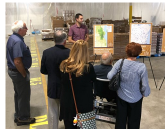
Hunger Task Force warehouse tour Sept. 29