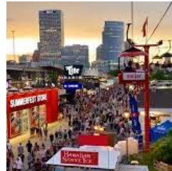
Random photos of Summerfest