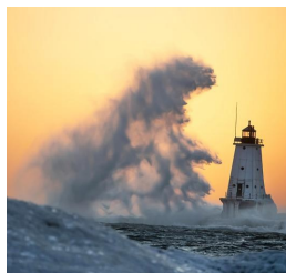
Monstrous waves over 57 ft