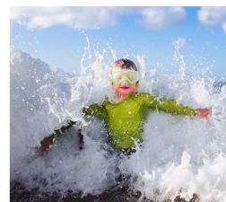
splashed in the ocean