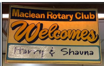
Photo: Left – Fassifern Valley RC Right – McLean RC Highland Welcome