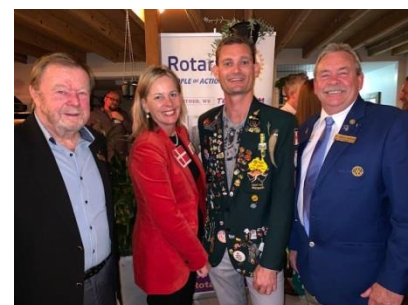
Connecting with YEP Alumni

Support of youth within the district was again highlighted throughout the month with successful driver awareness programs being held with over 200 students attending Driver Awareness training between our coastal and New England regions. The RYDA program has become an important part of our youth’s development education raising their levels of awareness and responsibility before getting their licence and taking control of a vehicle. Well done!