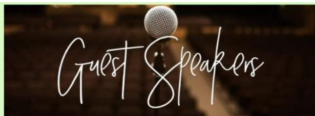
Potential Guest Speakers

We have a new page on the D9640 Website, under the Members Only Menu , Help and Information. The page is to list potential guest speakers for clubs to contact.