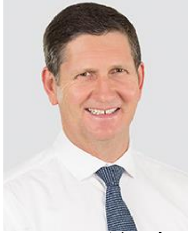
Hon Lawrence Sprinborg, former Queensland Member of Parliament & Opposition Leader