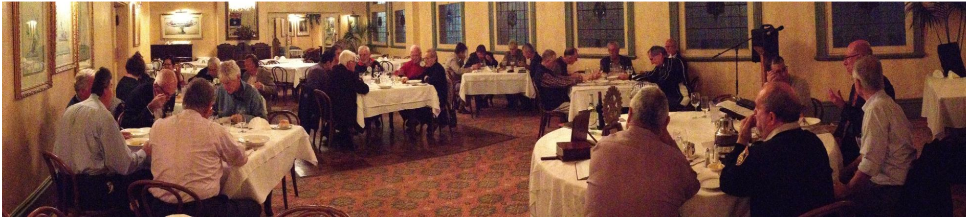
Panorama view (does not capture movement well, apologies)