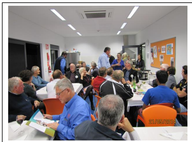
Food time in the kitchen