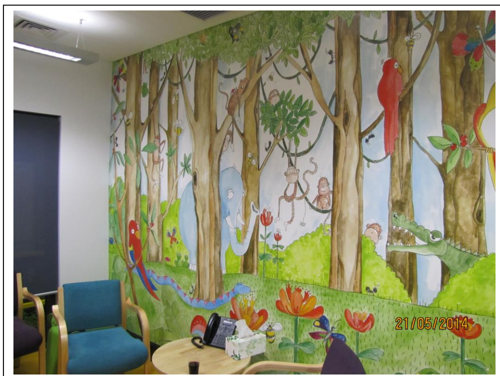
Children's interview area