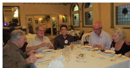
Some of the happy chappies!