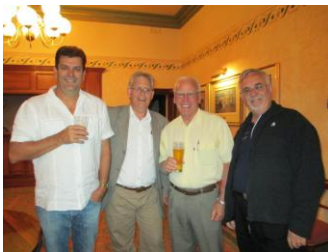
Some of the good lookers at the meeting!