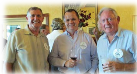
Catching up after the Chrissy break