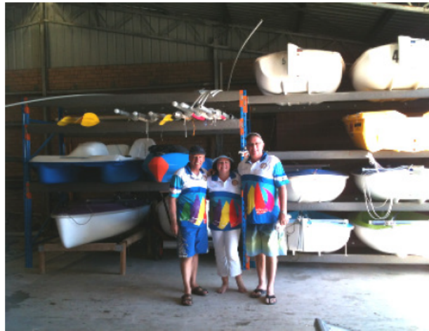
Brilliant new storage racking system from Instant Racking - Bunbury

work fundraising at last year's Black Tie Dinner event, Rotarians subsequently raised $5157 to ensure the ongoing success of this fantastic programme. Thank you to the organising committee and all those who rallied friends to attend the evening. I know the Sail into Life Committee Members and Volunteers who attended South Bunbury's dinner meeting on 30 January to receive this generous donation really enjoyed the welcoming atmosphere.