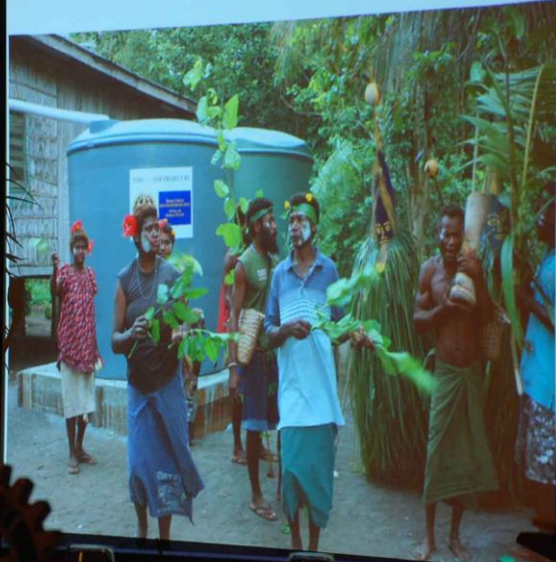
Loi Loi Village says Thank You