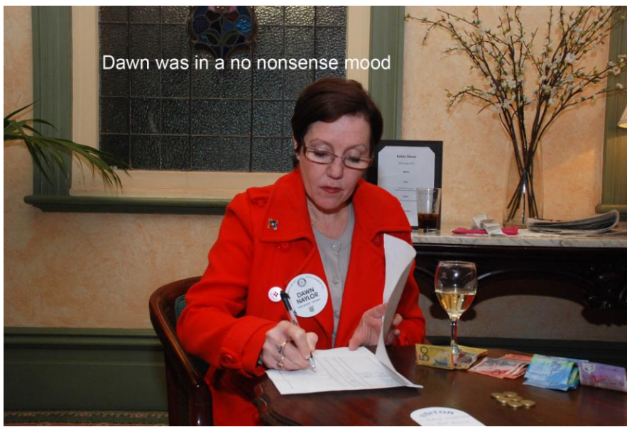
Dawn was in a no nonsense mood