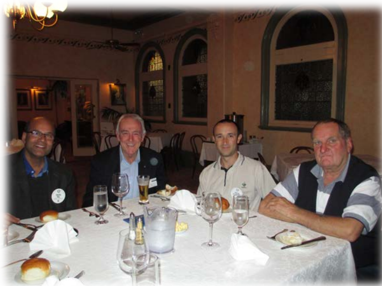
Look who came to dinner tonight! Nice one boys!