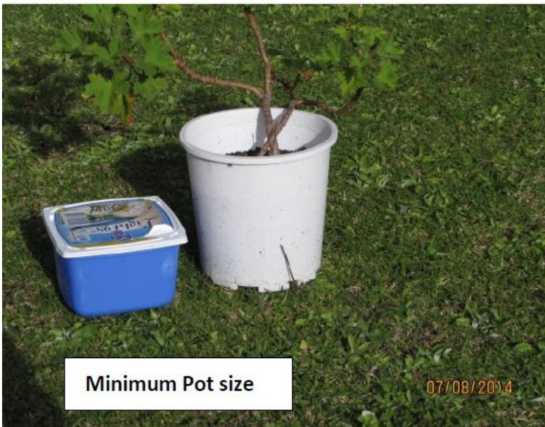
Minimum Pot size