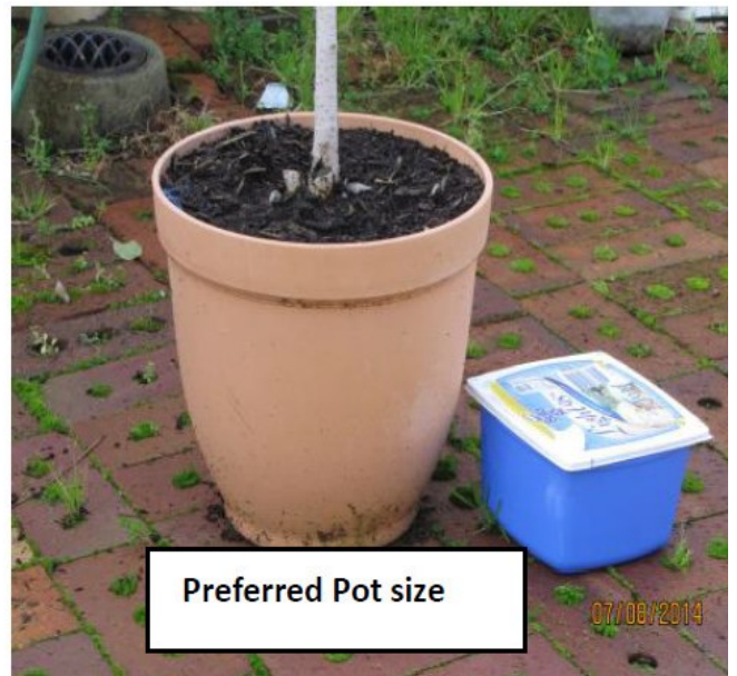
Preferred Pot size