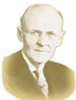
Paul P. Harris, Founder of Rotary 23 February 1905