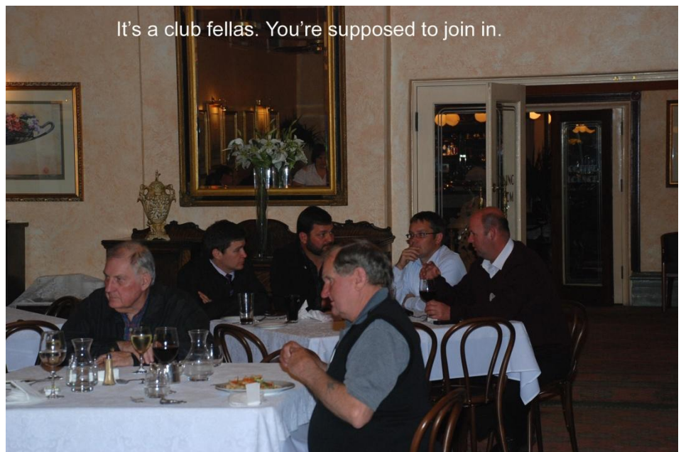
It's a club fellas. You're supposed to join in.