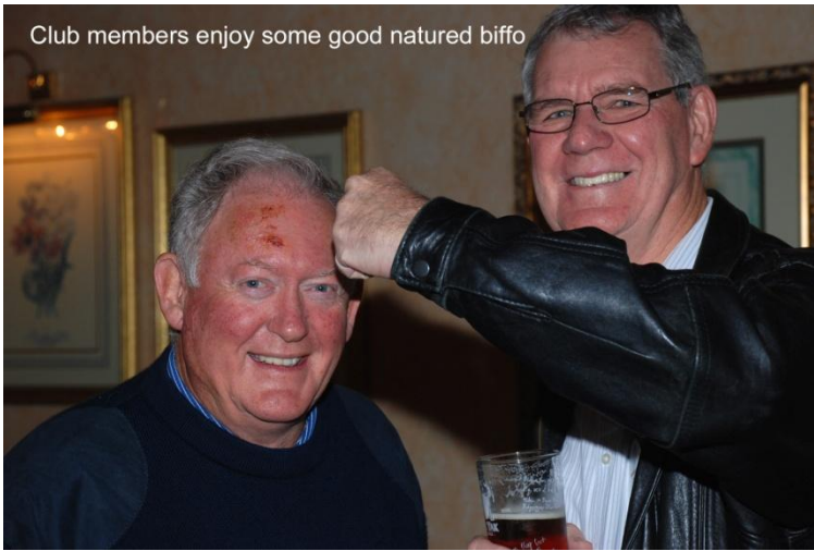
Club members enjoy some good natured biff