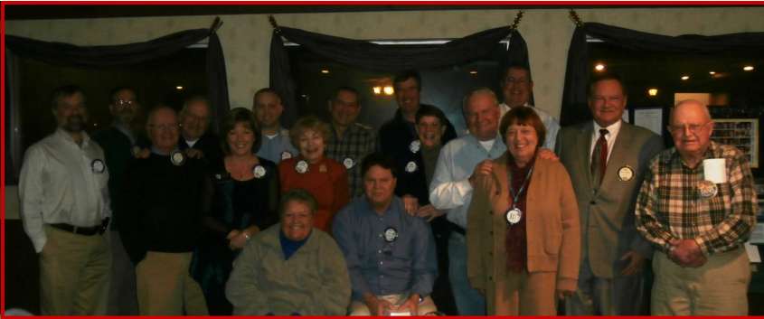
Avon Rotary Foundation Sustaining Members recognized at our December 11th meeting

dard housing by constructing affordable, well-constructed houses that are reliable and cost efficient to maintain. The home in Avon was designed to be especially efficient with utility bills anticipated to be under $200.00 a year. Livingston County Habitat for Humanity currently has 11 projects underway and is looking for additional land for future houses. You can view pictures of the Avon house along with a list of volunteers (many of them Avon Rotary members) at http://livingstoncountyhabitat.org/volunteer.html on the Habitat webpage. Thank you to all the members of Rotary who helped on the house and demonstrated service above self.