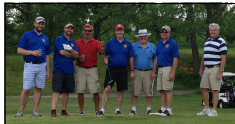
Flashback to 2012 Quad Cities Event