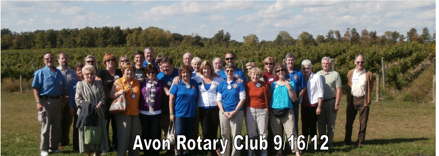
Avon Rotary Club 9/16/12