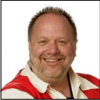
Gary The Happy Pirate