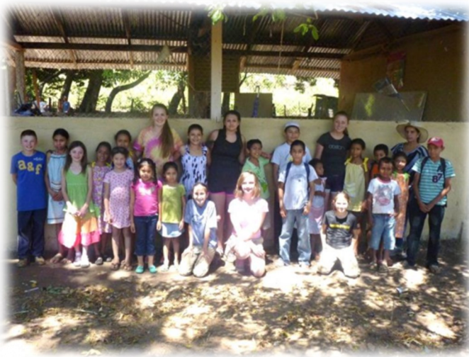
Volunteers are pictured with students in front of the old school in Piedra de Agua which was made of adobe, was over twenty years old, and needed to be replaced.

The Piedra de Agua community, located at the top of a mountain, has twenty-two homes in which one hundred-twenty people live. The school structure pictured left, served over twenty children yet was in a dilapidated state. Students expressed their gratitude for replacing their school, which they repeatedly said was dangerous. The demolition of the school was not difficult, as the walls were made from sand, clay, water, and organic material. Once the roof and support beams were removed, volunteers easily pushed the walls over with a slight nudge. A preschool was put in its place, while a larger, school was built for elementary grades on the same property shaded by mango trees.