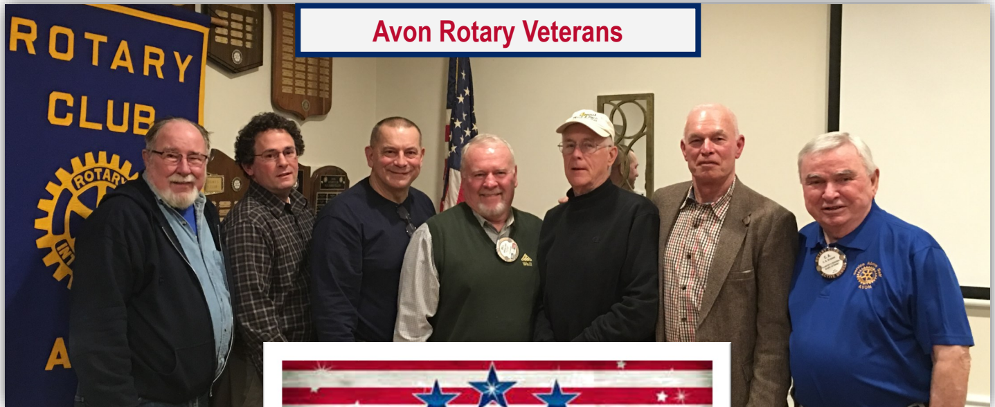
Avon Rotary Veterans