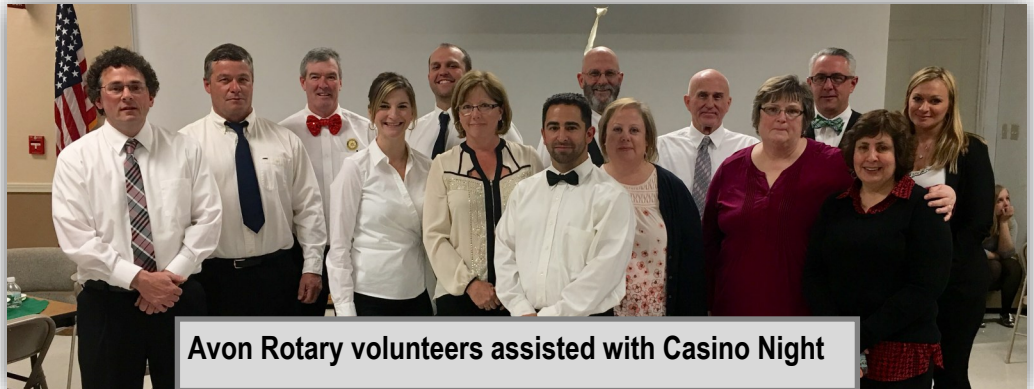
Avon Rotary volunteers assisted with Casino Night

Saturday started bright and early with Exchange students needing to attend a meeting from 8:50 to 11:30. The bus