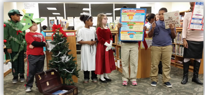
School #33 Students with their new books

The event ended with a promise to continue the tradition next year!