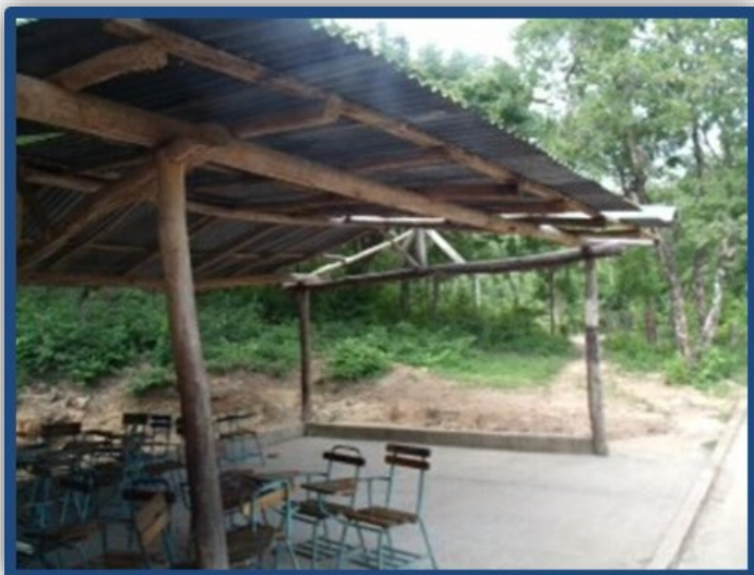
This school in Las Mercedes will be replaced.

One of Rotary's six areas of focus is supporting basic education and literacy. Worldwide, sixty-seven million children do not have access to education and more than 775 million people over the age of 15 are illiterate. One of Rotary's goals is to strengthen the capacity of communities to support basic education and literacy, reduce gender disparity in education, and increase adult literacy. The Avon Rotary Club has been supporting this goal since its inception, and over the past four years has been "a gift" to numerous communities in rural Nicaragua.