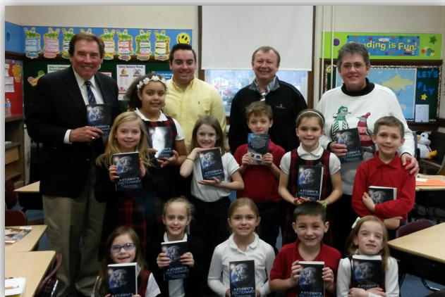
Above: St. Agnes 3rd Graders received their dictionaries 2/9/16

Very few life moments are as rewarding as the opportunity to empower a child with a new tool to be a better communicator, all the Rotary members and School administrators had the privilege of one of those cherished moments. I want to relay a Big Thank you to all the volunteers in the fundraising events which make such great moments possible.