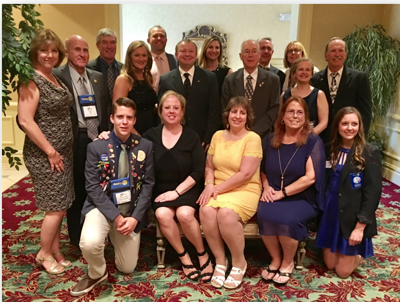
May 2017 District Conference Attendees from Avon Rotary

I had a great time at the Conference. I would recommend attendance to all members. Having a critical mass of Avon attendees made it also a great opportunity to spend free time with our friends and get to know them better.