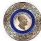
Paul Harris Fellow

Our decision to become a sustaining member may have gotten even easier with recent news that Charity Navigator has recently given the Rotary Foundation a perfect score of 100. Charities with scores of 100 execute their missions in a fiscally responsible way while adhering to good governance and other best practices that minimize the chance of unethical activities. The Rotary Foundation earned perfect scores for its financial health and its accountability and transparency. Those two scores then translate into a perfect 100 point overall score. Less than one percent of the thousands of charities rated by Charity Navigator have earned perfect scores. In days when other "charities" are being called into question, The Rotary Foundation stands head and shoulder above many others and is actually "Doing Good in the World" .