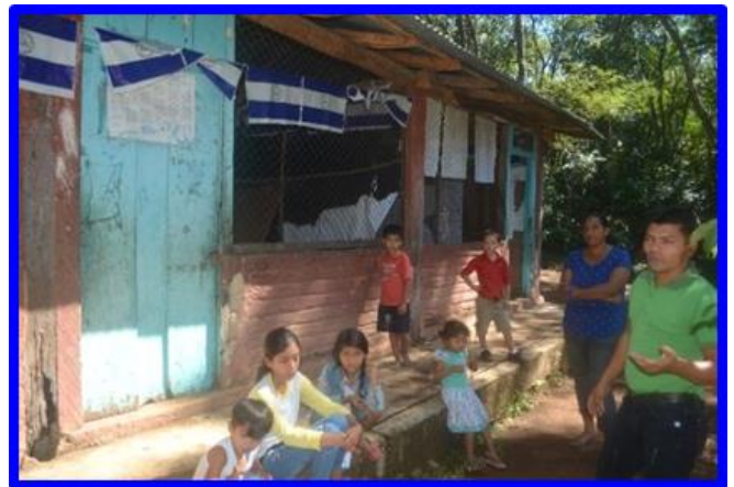
Due to frequent seismic activity in Nicaragua, the entire structure is vulnerable to failure and collapse.