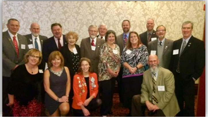
Pictured: Avon Rotarians at the Eastern Cities Dinner Another great showing for our club.