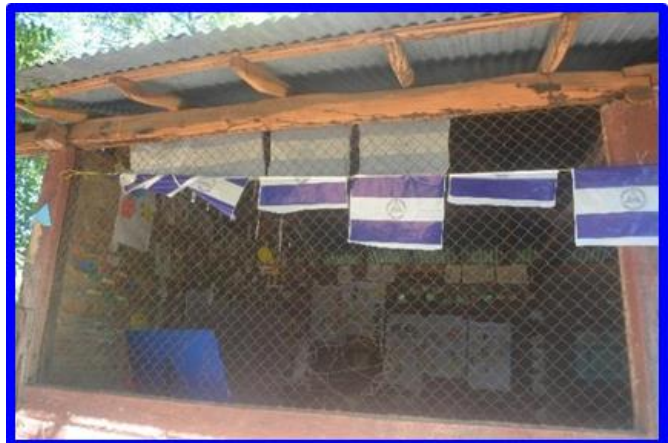
This small structure will be replaced by a team of Avon Rotary volunteers.